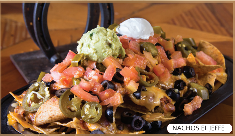
NACHOS EL JEFFE

Crispy pickle slabs fried to a perfect golden brown. Served with ranch. 5.95