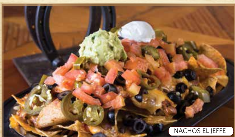
NACHOS EL JEFFE

Crispy pickle slabs fried to a perfect golden brown. Sprinkled with parmesan cheese and served with ranch. 5.95