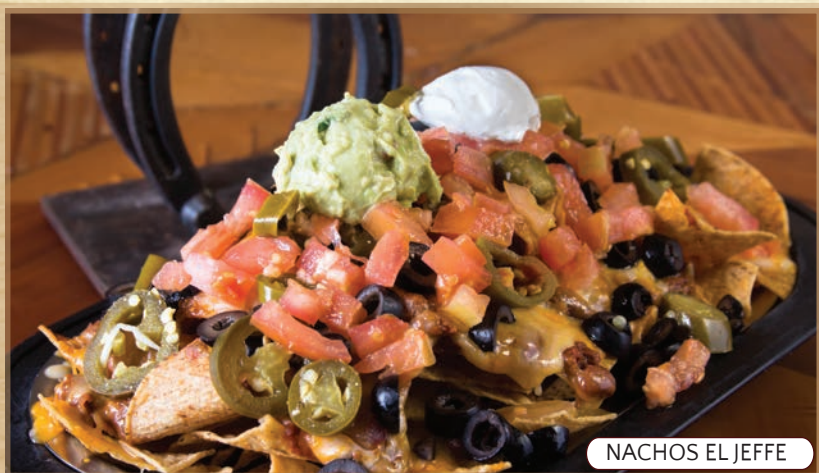
NACHOS EL JEFFE

* Consuming raw or undercooked meats, poultry, shellfish or eggs may increase your risk of foodborne illness.