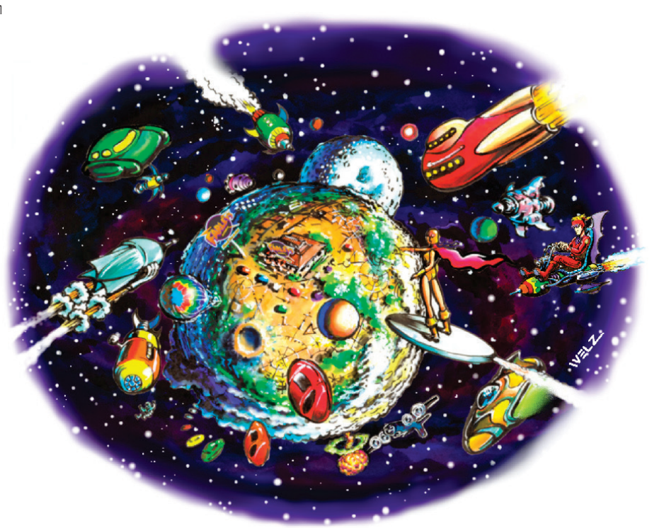
OFFICIAL FARLEY'S T-SHIRTS & OTHER NEAT GOODIES ARE AVAILABLE RIGHT HERE. ASK YOUR SERVER FOR DETAILS